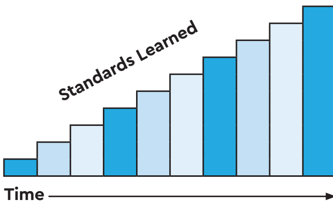
Figure 2: Standards Learned Over Time

This difference, in the time for instruction/learning, did show impact on the prediction of ClearSight Interim to ILEARN, and this is reflected in the tables that you can use to predict students' ILEARN proficiency (Table 1 and Table 2). Generally, the study reflected that the more time students had to learn standards (Figure 2), the better they performed on the ClearSight Interim—as it measures grade-level standards mastery and students should have more knowledge of these standards as time progresses.